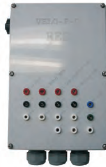
e.g. Distributor VELO-P-C