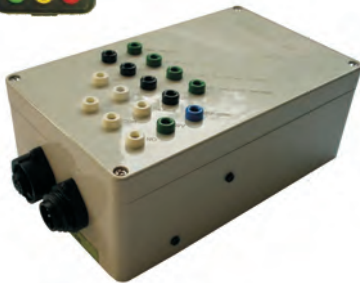
e.g. Distributor VELO-M-A

Controller Timy: to control the display board (countdown function and lap counter), as well as backup timer